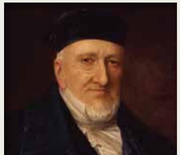
Sir Moses Montefiore Bart., 1881