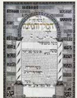
Letter to Sir Moses from a scribe asking for work

The Montefiore Endowment was established in 2007 as a charitable company limited by guarantee and governed by independent trustees. Among the aims set out in the governing instrument of the Charity are: