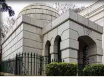
The Montefiore Mausoleum, Ramsgate