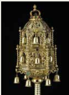
A rare silver-gilt rimon, Montefiore Collections 1771