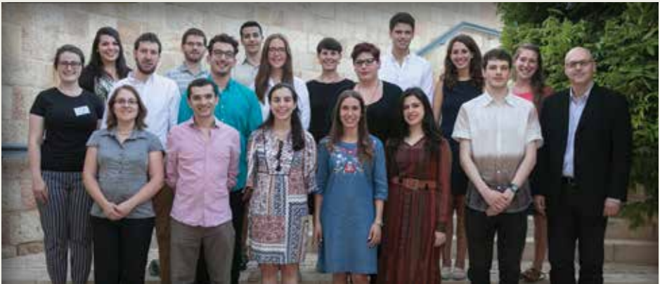
Graduates from leading UK universities at Montefiore Leadership Course, Jerusalem 2015

The unique Montefiore Dayanut Course commenced in November 2016 and uses the latest internet techniques to enable rabbis from Australia, Canada, Germany, Hong Kong, Israel, the Netherlands, Turkey and the U.S.A. to participate in the learning together with rabbis from the UK. The teaching is delivered by Eretz Hemdah; and graduates will receive Eretz Hemdah's semicha 'Yadin-Yadin for the Diaspora'.