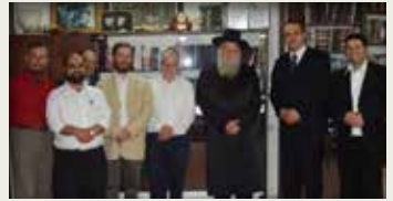
Rav Kook greets semicha students in Israel

The course is planned to last for just under 4 years plus one or two terms , depending on progress, for those with good preliminary knowledge.