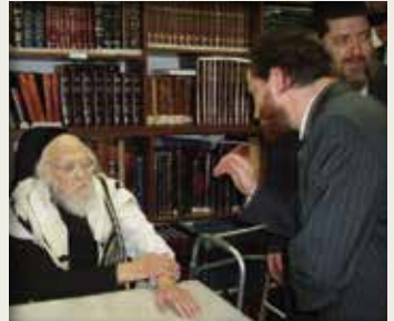
Semicha students visit Rav Eliashiv during study-course in Jerusalem