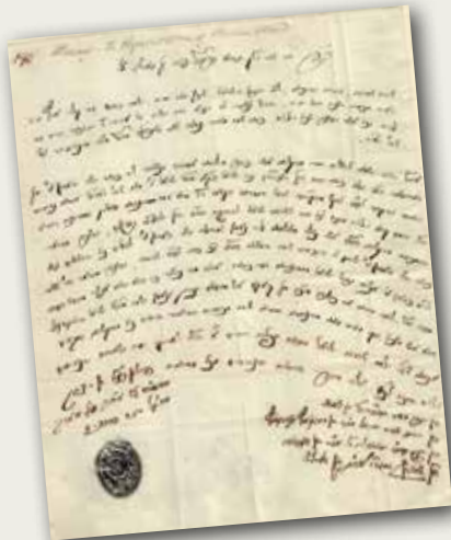
Letter from the Ger Rebbe to Sir Moses Montefiore 1845