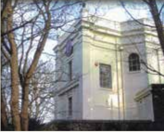
The Montefiore Synagogue, Ramsgate